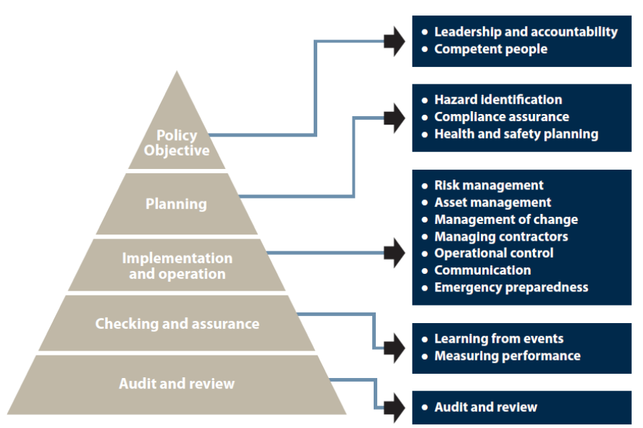
Figure 1 Health and safety principles of the Tata Steel Health and safety policy.

or equivalent will be deemed to satisfy this requirement. In the absence of such frameworks, we recommend that health and safety policies and practices follow the 15 principles laid out within the Tata Steel Health and safety policy which are outlined below (Figure 1).